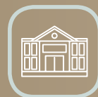
Register at Consulates