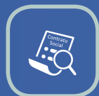
Registry of Commerce