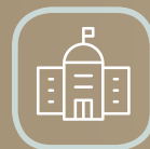
Register at Itamaraty