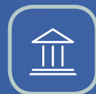
Central Bank of Brazil