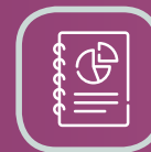
Accounting Reports (BRGAAP / USGAAP / IFRS)