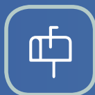
Tax or Virtual Address