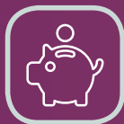
Ancillary Obligations (Tax / Accounting)